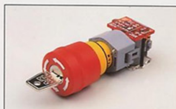
Series 04 E. Stop Key Release