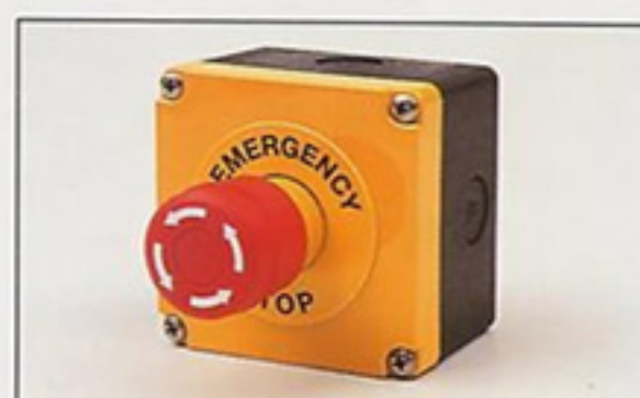
Series 04 E. Stop Twist Release