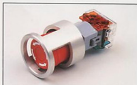
Series 04 E. Stop Twist Release with Protective Shroud