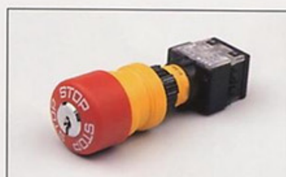
Series 61 E. Stop Key Release