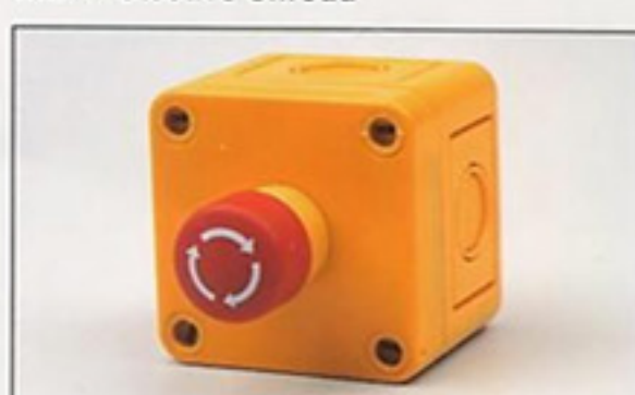
Series 61 E. Stop Twist Release in Enclosure